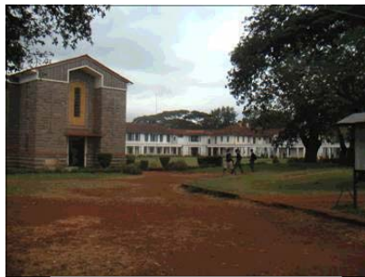
Chapel and Main Quad

We then walked up the road past the Science Block, Main Quad and Chapel, and on up to Grigg/Hawke (now Kirinyaga/Baringo). The Chapel is in excellent condition and nicely kept. On the way we passed many students who wear the same uniform as we did and no socks down around the ankles or shirts hanging out! We were told that they are very proud to be at the School because of its history.